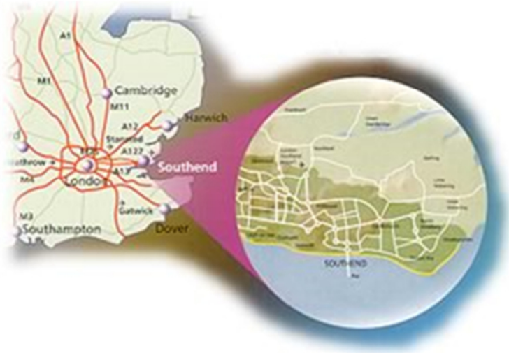
Figure 2.1: Southend-on-Sea’s location

2.13 Southend-on-Sea is a densely populated urban area covering 4,175 hectares (ha), which equates to almost 42 residents per ha. Its density is high compared with other unitary authorities such as Thurrock and Brighton (10 and 31 residents per ha respectively). The most densely populated parts of the Borough fall within the districts of Leigh and Westcliff and to the east of central Southend where densities can be as high as 145 residents per ha. This is shown in Figure 2.2.